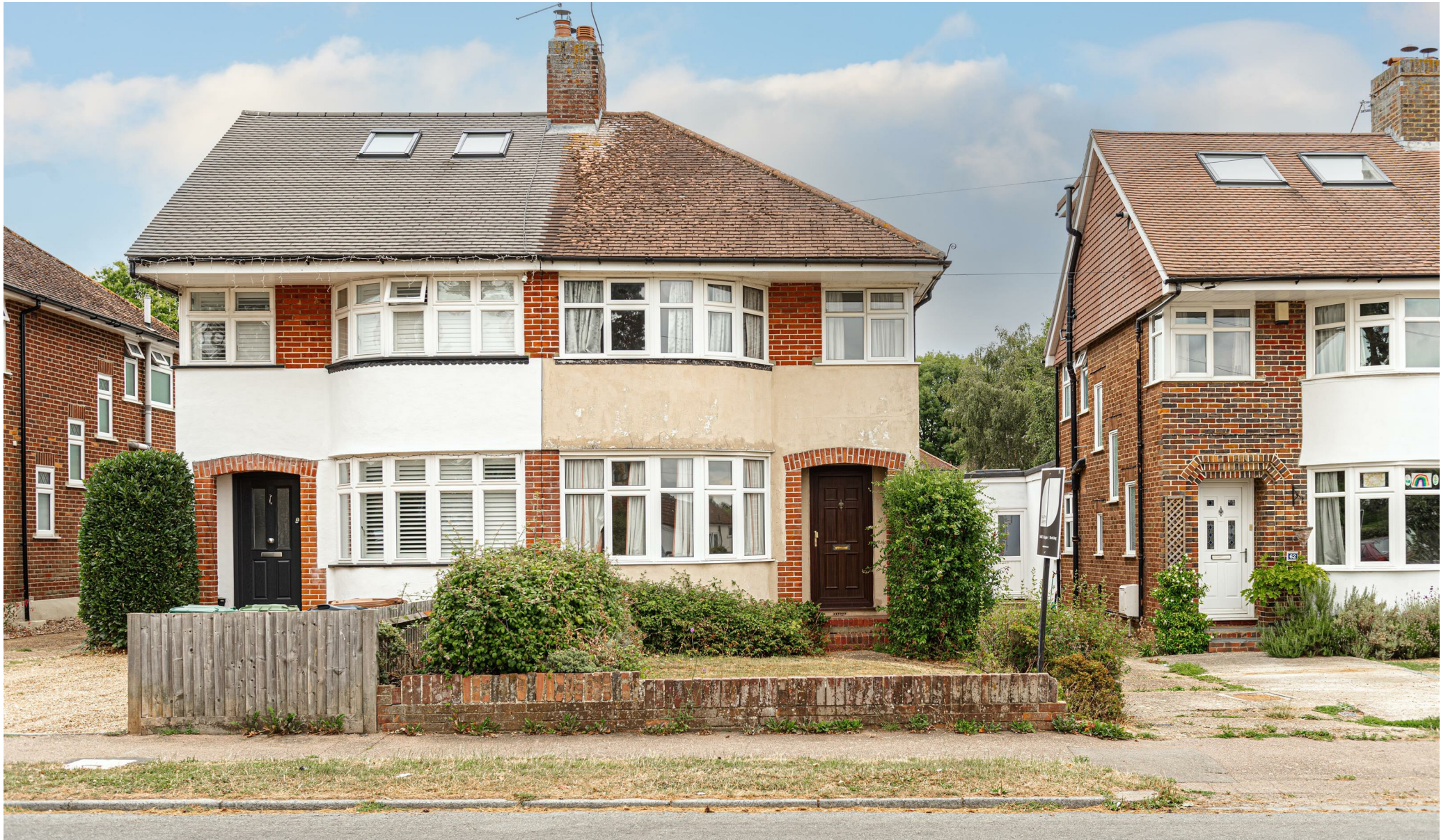
Sandcross Lane, Reigate £525,000